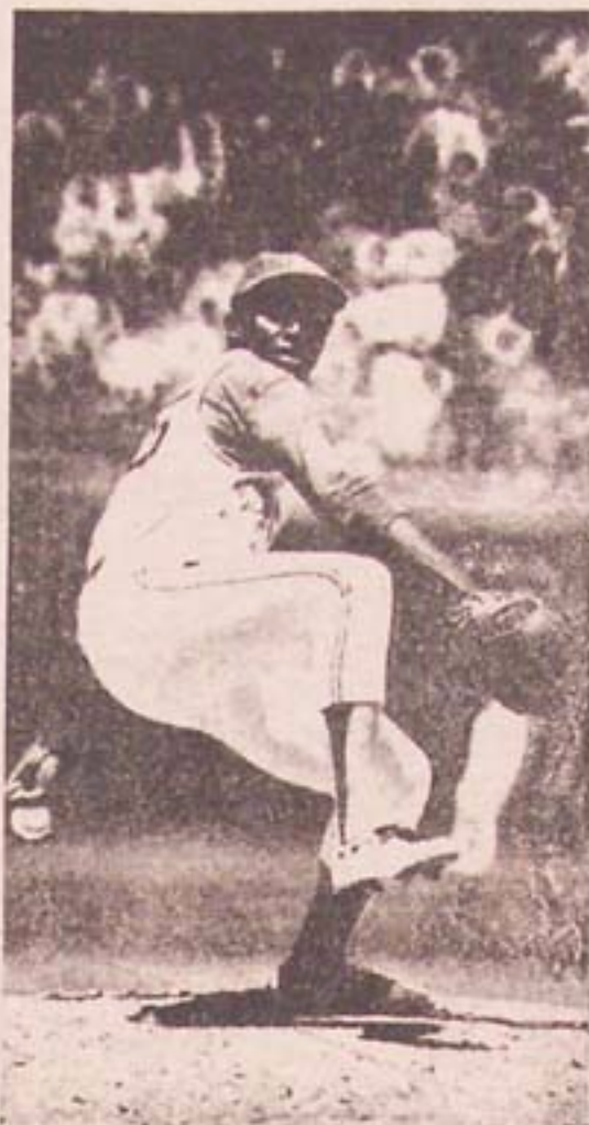
Despite a victorious baseball season, the mistreatment of BROTHER VIDA BLUE must be mentioned.

Charles O. Finley is the type of man, who, during one rained out game of the