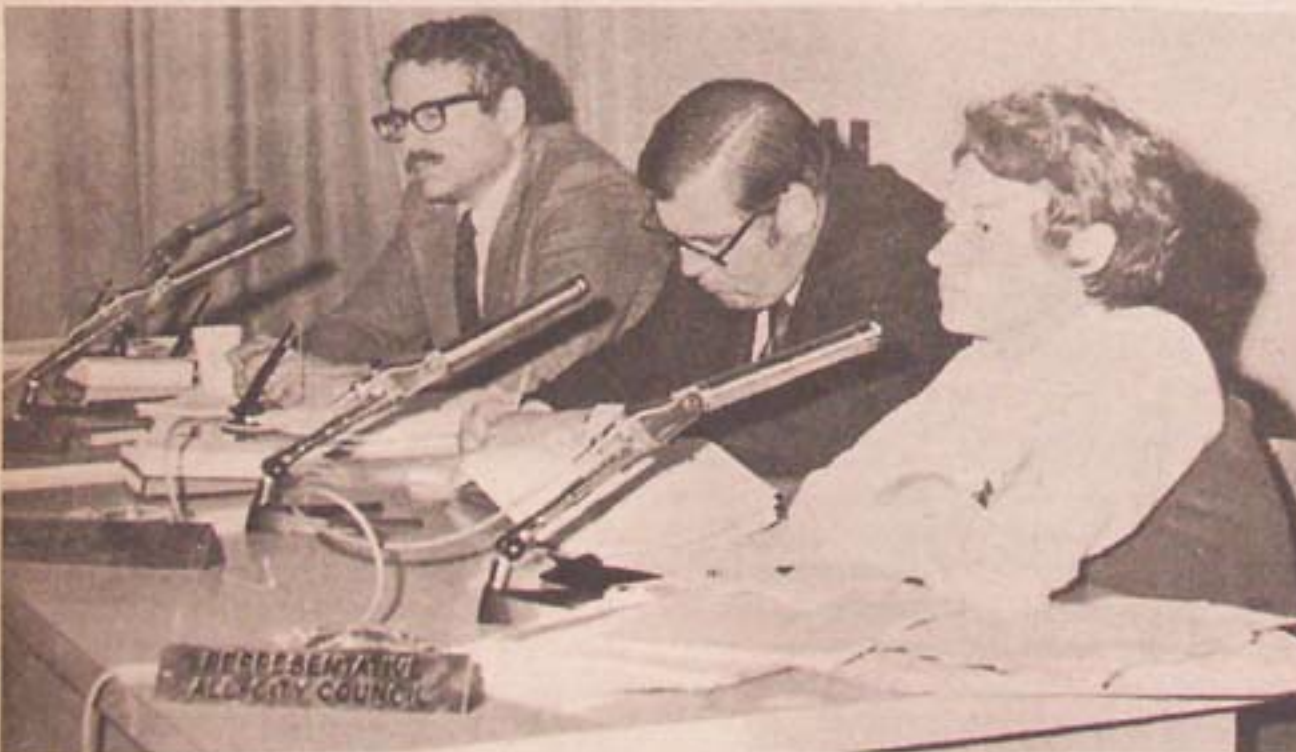
Both Black students and the Black community stand opposed to the racist Board of Education proposal for teacher cut-backs.

The issue of quality education holds a special significance to our people. It combines the historic significance of something Black people have long been denied, with the feeling of the immediate need for change. Many methods have been suggested and practiced to correct the problem, and it seems thousands of barriers have