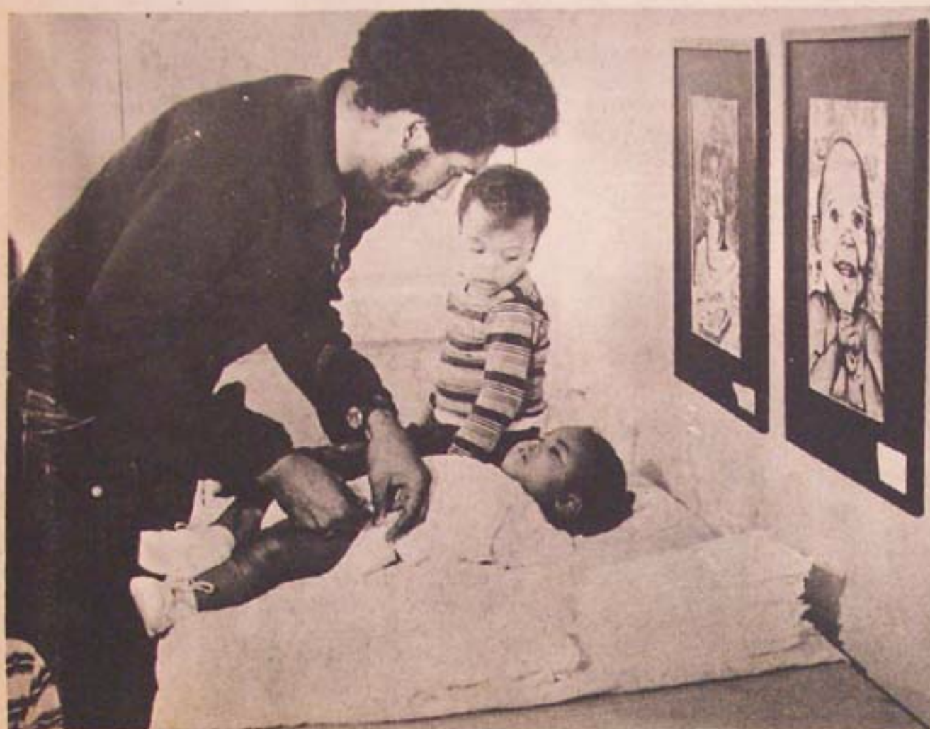
Anti-child care legislation affects countless Black families, especially welfare recipients trying to continue in school or in training for jobs.

Recently, many bills concerning welfare and other 'social services' have been passed (on the national level) that directly affect the survival of Black children. On the state level, California and its racist Governor Ronald Reagan, has led the campaign to take thousands of poor mothers and their children off the welfare rolls and have reduced the already meager sums of those who will still receive aid. These bills are all supposed to be 'reform measures', but under the disguise of trying to make the welfare and anti-poverty program systems better, these legislative acts are destructive, particularly to poor families with children. However, the fact that children are suffering from such actions doesn't matter to those that control the government and make the laws.