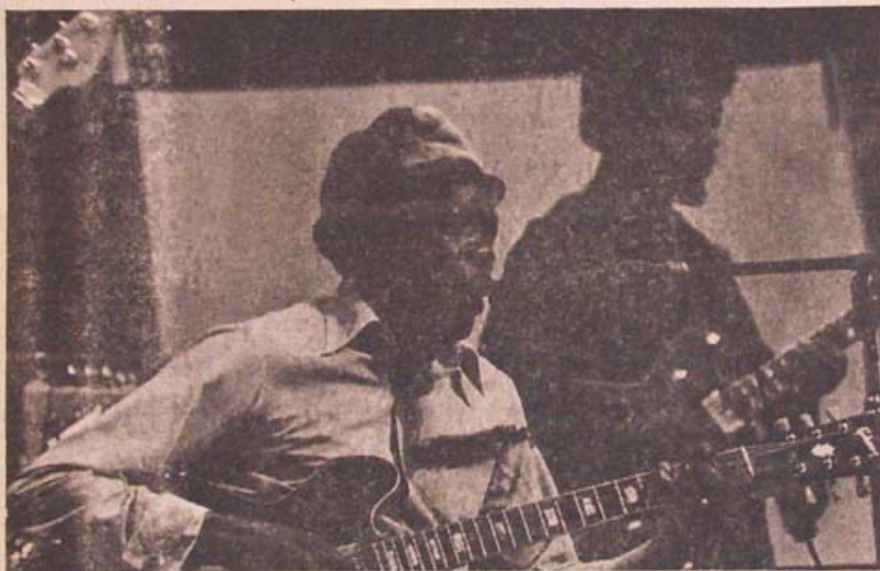
"Black entertainers should support Black people, I've been saying that down through the years." (Photo taken at Black Community Survival Conference, June 24, 1972).

NOTE: Brother Hooker's latest two album releases are: 'Never Get Out of These Blues Alive', and 'John Lee Hooker Live at Soledad Prison'. Both are on the ABC record label.